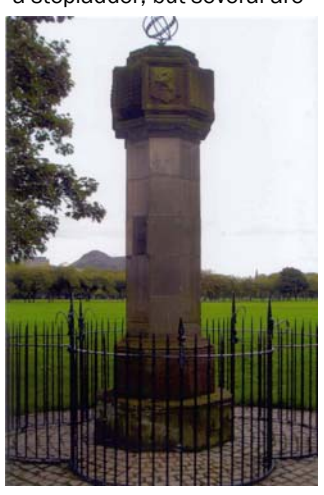
SRN 1306—The Meadows, Edinburgh

We would not expect to come across a dial mounted so high that it cannot be read without a stepladder, but several are