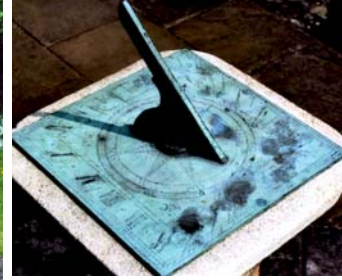
SRN 1086-Westminster College, Cambridge