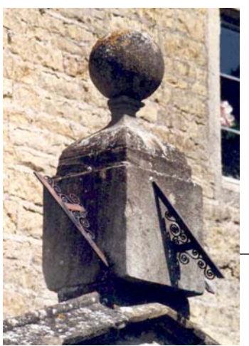
SRN 0023—The declining three face cube dial at Bourton-on-the-Water

We've all admired them and many of us have reported them but we haven't always recorded them. We're talking here of cube dials in their various forms. We have no fewer than 199 cube dials recorded