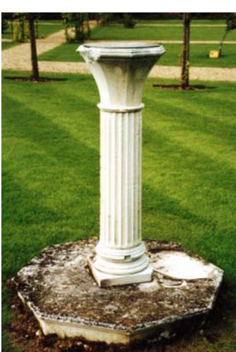
The stolen dialplate & its pedestal

As it happens, the dial had been recorded by Tony Wood, who was able to provide photographs of the instrument, Thus, it is just possible, if unlikely, that this sundial may resurface and that its recording may help identify it, in which case it would be nice to see it restored to Belmont House.