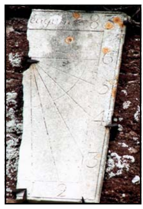
Dial at St Andrew's Kenn