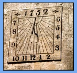
The clear winner! SRN 3165 - Great Witcombe