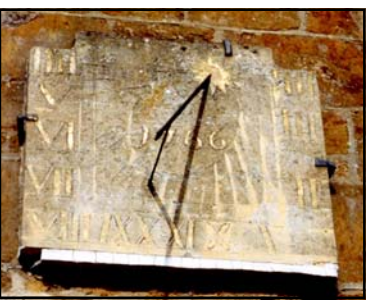
SRN 5363 at Dial House

ogy had helped locate the dial and enabled its location to be entered into the Register. All in a few minutes and all from one's desk too!