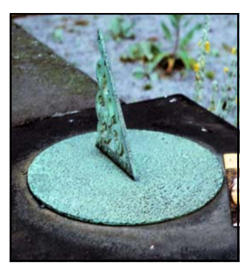
The horizontal dial at Chatsworth as it was in September 1977

So, the dial does exist at Chatsworth and it's just that the area at the SE corner of the house has since been placed out of bounds to visitors which explains why no one else has got to record it