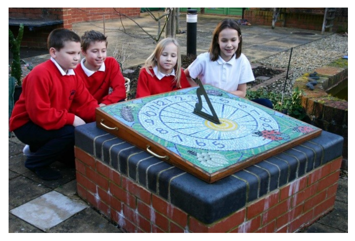
School Dial, 2005