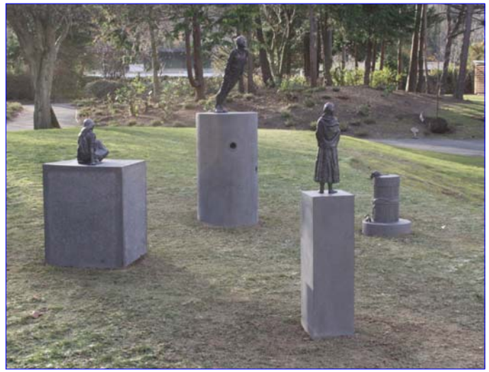
Fig. 11. "Frae Furrow tae Firmament in Four Lowps; The Fourth Lowp". A sculptural sundial forming the fourth in a series of linked sculptures sited throughout the Robert Burns Birthplace Museum, Alloway. Bronze figures cast from clay originals on cast Jesmonite plinths. Commissioned by the National Trust for Scotland, 2010.

By this time I was eager for a chance to incorporate a sundial into a large scale public work; after all, the Sundial can be seen as the ultimate site-specific artwork, with its configuration and positioning being so precisely determined by its location. In 2010 I got the chance to do this in a commission for the West Lothian town of Linlithgow. This sundial celebrates an apocryphal local character, a 19<sup>th</sup>-century cattle drover called Katie Wearie, shown resting in