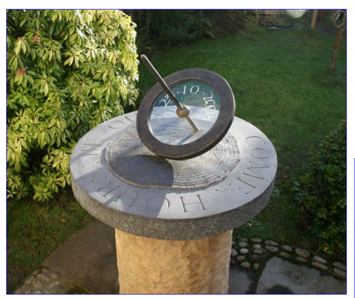
Fig. 6. Combined equatorial and horizontal dial. Cast Jesmonite AC730, bronze and glass on a carved oak pedestal. Private commission 2009.

At this point, I was realising that as well as relating closely to the significance of the Sundial at a conceptual level, I was finding that my favoured sculptural forms and materials were particularly suited to the making of sundials. As far as my choice of materials goes I'm a bit of a Jack of all trades: I work in a wide range of materials and happily mix and adapt them to suit the project in hand. But most of my work is rooted in modelling and carving, using clay, plaster, and sometimes wood. Moulding and casting are central to my work to achieve my final results and a material that I frequently cast into is a concrete-based casting medium with a stone powder aggregate called Jesmonite AC730, which I will refer to simply as 'Jesmonite' throughout this article. I work extensively in bas relief and I have had a longstanding interest in cut lettering and the inclusion of text in sculpture, all of which fit in well with sundials.