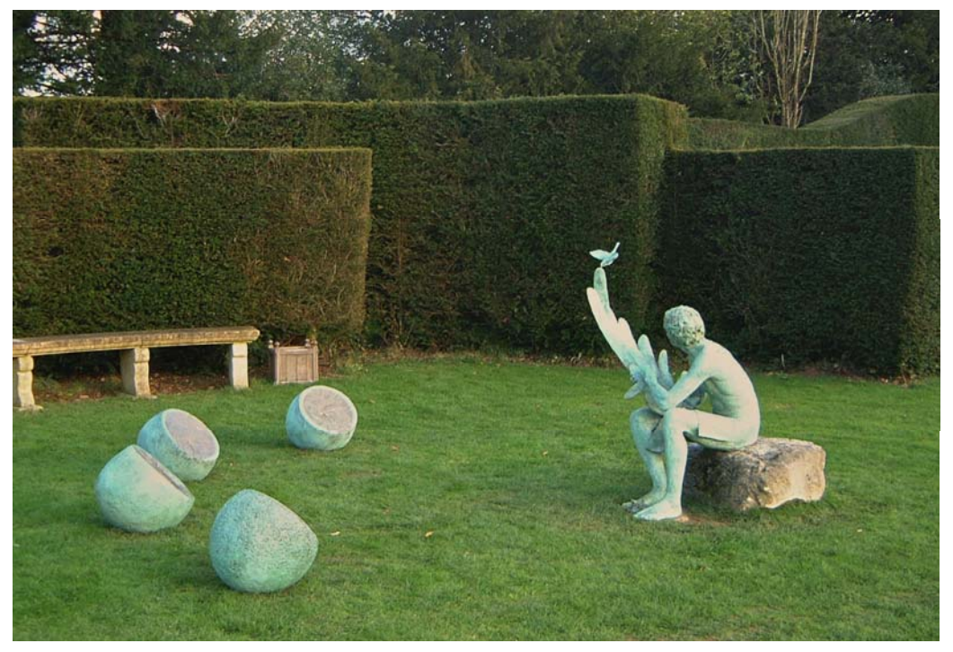
Fig. 2. Daedalus the wingmaker; Sun sculpture. Cold cure cast bronze. Private commission, Wiltshire. 2002.