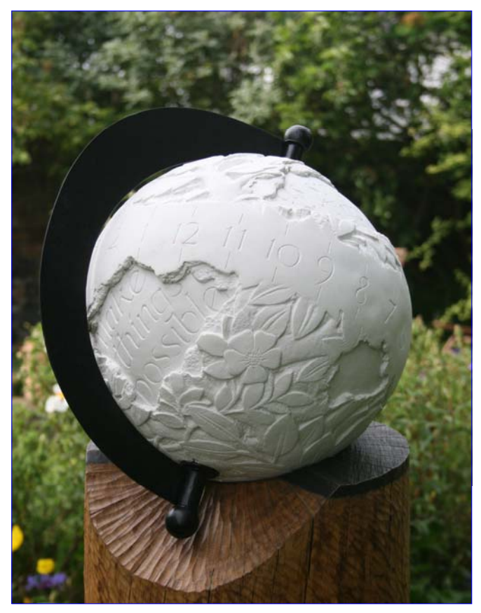
Fig. 9. Sphere Sundial. Cast Jesmonite AC730 on carved oak plinth with mild steel bracket. Private commission

The top of the tree stump forming the plinth is capped with a profiled sheet of cor-ten steel, a steel that forms a surface rust without continuing to degrade. The face of the dial is cleft by a wedge of the same material, forming the gnomon. As well as having an intrinsic aesthetic appeal, I felt that rusted steel carried an echo of the intense industrial innova-