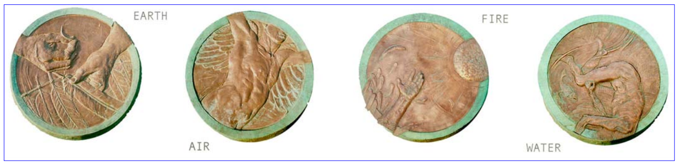
Fig. 3 (below). Daedalus the wingmaker; the four narrative images highlighted in sequence by the passing shadow of the bird.