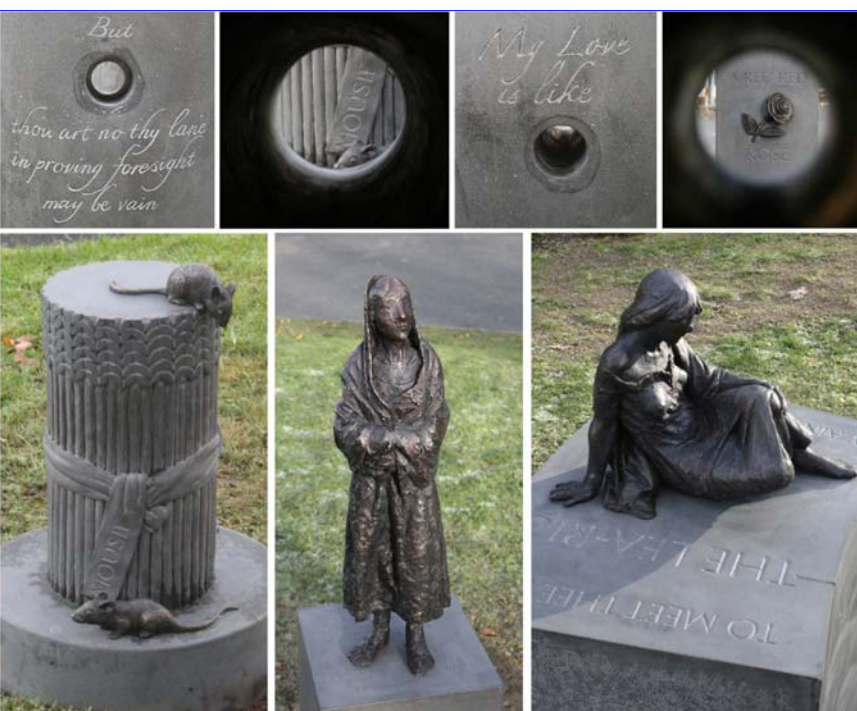
Fig. 13. Details of Fig. 11; The 9am, 1pm and 4pm hour marks and the spy holes on the main plinth with views through them.

another situation. When confronted with the arrival of a new sculptural installation the response often seems to run a bit like this; "So what's all this then? ....Oh it's a Sundial!". Suddenly the sculpture has justified its presence!