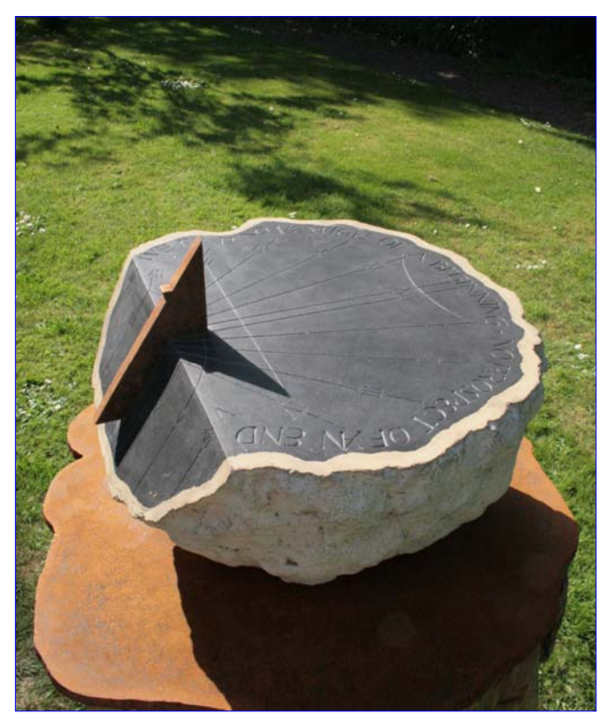
Fig. 8. A Sundial for the Scottish Enlightenment. Cast Jesmonite AC730, with cor-ten steel on a tree stump. Commissioned by the Royal Circus Garden Committee, 2010.

turies (Fig. 8). The dial carries the inscription "We find no vestige of a beginning; no prospect of an end". With these words in Edinburgh in 1788 James Hutton announced the arrival of Deep Time. His geological discoveries overturned Bishop Ussher's biblical chronology in which the Earth had been created in 4004 BC, revealing a timeframe too huge for the human mind to grasp. What better subject for a sundial?