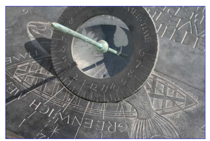
Fig. 5. Combined equatorial and horizontal dial. Cast Jesmonite AC730, bronze and glass. Commissioned by the Museum of the University of St Andrews, 2008.