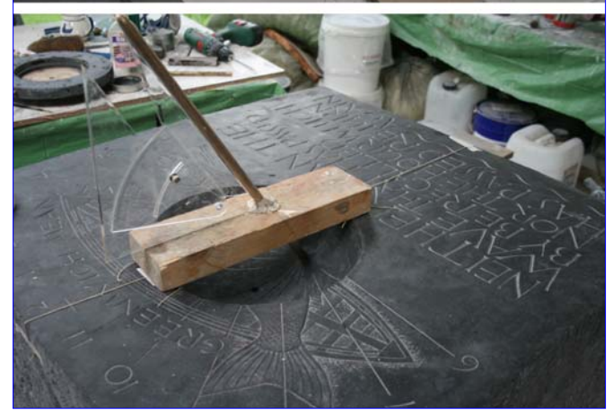
Fig. 7. Setting the gnomon for the St Andrews University Museum Sundial: first, the bronze rod was set in the wax original to form the gnomon and then, after incorporating the gnomon in the mould, preserving its position exactly, the cast was made round the gnomon, replicating its position in the final result.