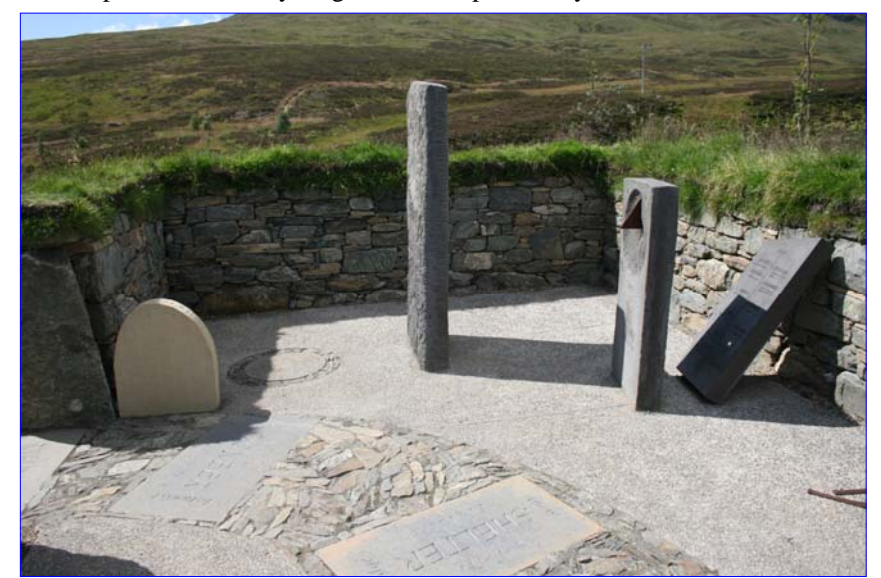
Fig. 14. Interpretive Sculptures in a "Ghost Sheiling" enclosure; incorporating a vertical sundial and solar calendar as part of the overall scheme. Cast concrete, stone and cor-ten steel. Commissioned by the National Trust for Scotland, 2012.

While hopefully working at a purely decorative level, this work is dense with content and requires a fair amount of unravelling. I felt this element of puzzle and enigma was appropriate to the situation and subject matter, and the sundialling aspect of the work fitted into this well. It highlighted for me just how much people love the abstract qualities of sundialling, and how ready they are to accept what could almost be described as a conceptual dimension to sculpture where they might well be put off by this in