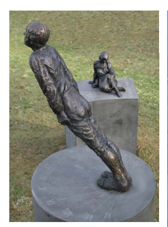
Fig. 12. Detail of Fig. 11; The Burns Sundial gnomon.

Gie me the hour o' gloamin' grey, It maks my heart sae cheerie-o to meet thee on the Lea Rig My ain kind dearie'o